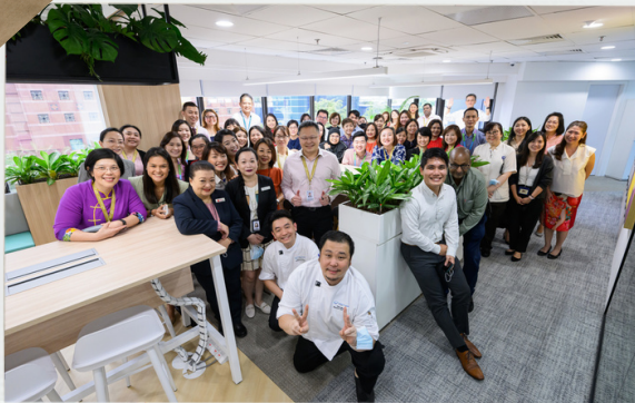
You make it Possible

Chief Executive Officer, Mount Elizabeth Hospital