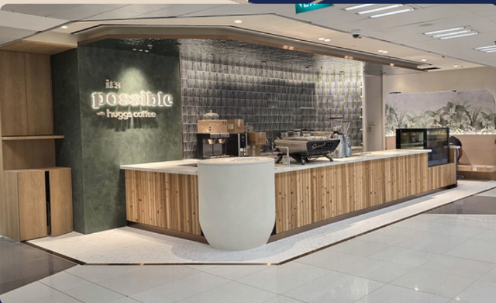
MEMC LEVEL 2 Huggs Coffee