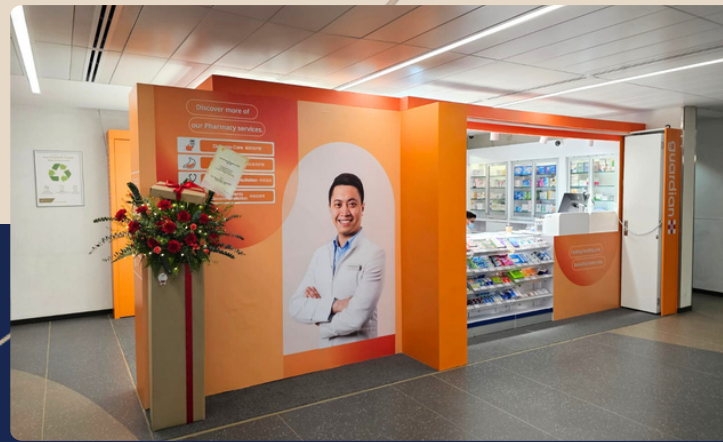
MEMC LEVEL 3 Guardian Pharmacy (Temporary Site)

MON-FRI: 9am - 6pm SAT: 9am - 1pm SUN & PH: Closed