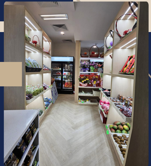
MEMC LEVEL 1 Mount E Singa Fresh

MON-FRI: 7.30am - 9pm SAT, SUN & PH: 7.30am - 8pm