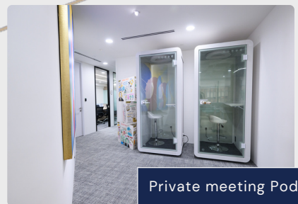
Private meeting Pods