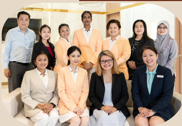
Our dedicated team