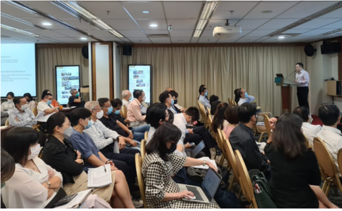
Extraordinary General Meeting, 04 August 2022

On 04 August 2022, an Extraordinary General Meeting was held with the subsidiary proprietors. The objective was to seek mandate for various aspects of Project Renaissance. We were encouraged by the 100% and 99.7% support for the two resolutions presented.