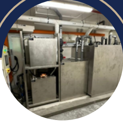
New Decay Tank - Completed in 2022