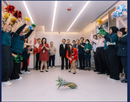
Welcoming our Doctors