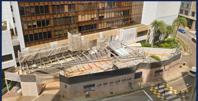
Structure Constructed, with Glass roof installation and M&E Services schedule in March 2025