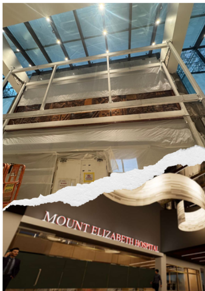
Guan Gong Mural Protection & Future Sky Atrium