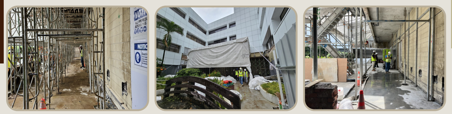
New Garden Linkway- Raw & Structural perspective

A new garden linkway is being built to enhance Patient and Staff Movement. Although it may seem like a minor addition, our new linkway will play a significant role in diverting patient and staff traffic away from public corridors in the future. The linkway, which connects Towers B and C, enables patients to travel effortlessly from their wards to the upcoming Main Radiology Complex and Major OTs.