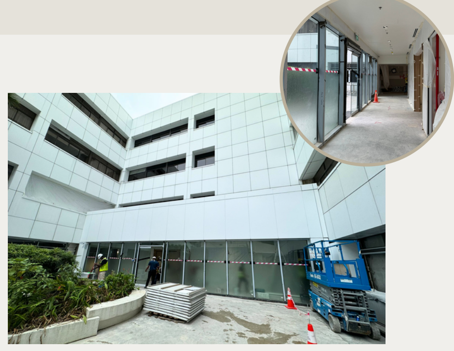
New Garden Linkway

We are excited to announce that the linkway will be launched with the two new lifts.