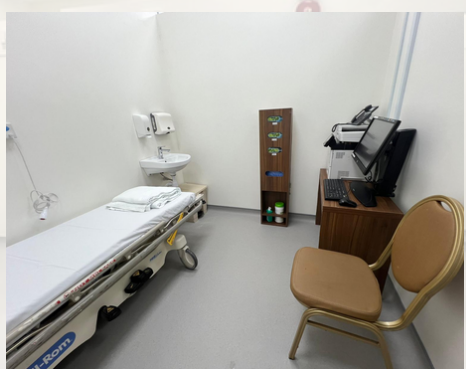
Operational from October 2023